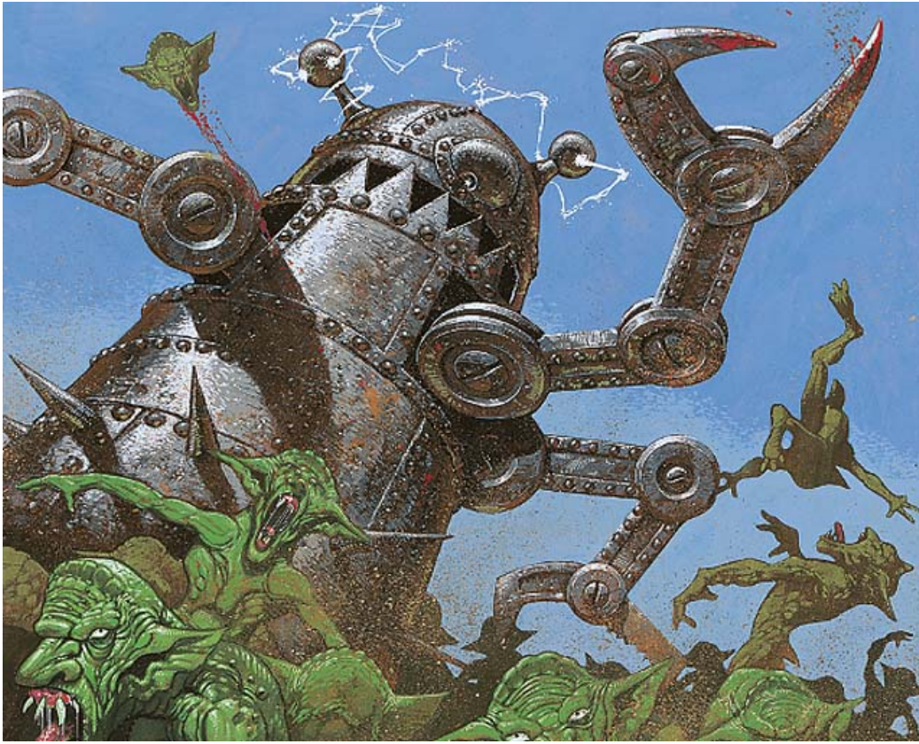
Mindless Automaton art by Brian Snoddy